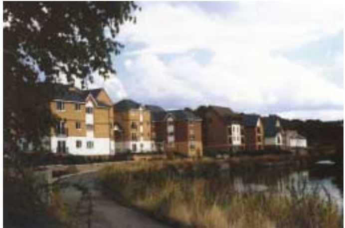
Figure 9: 1996 Quayside Village. Exclusive riverside houses

Sadly, the Butler's tar works has gone and has been replaced by the Quayside Village.