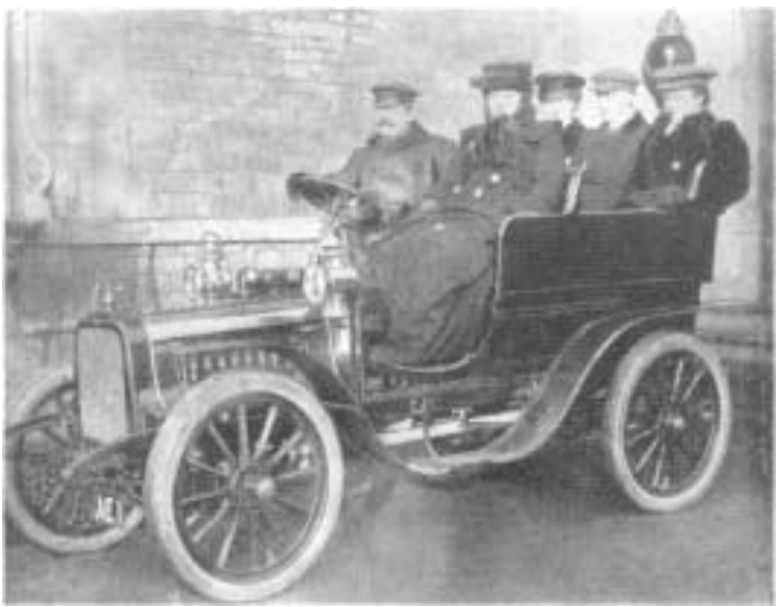
Figure 6: The first registered motorcar in Bristol. AE 1 in 1904