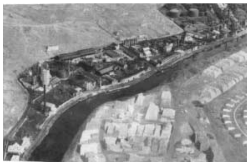
Figure 1: 1954 Crew's Hole Tar Works from the air

When the Conham Chemical Works closed in 1904 and Stone and Timson's in 1924, both sites were incorporated into the Butler Works.