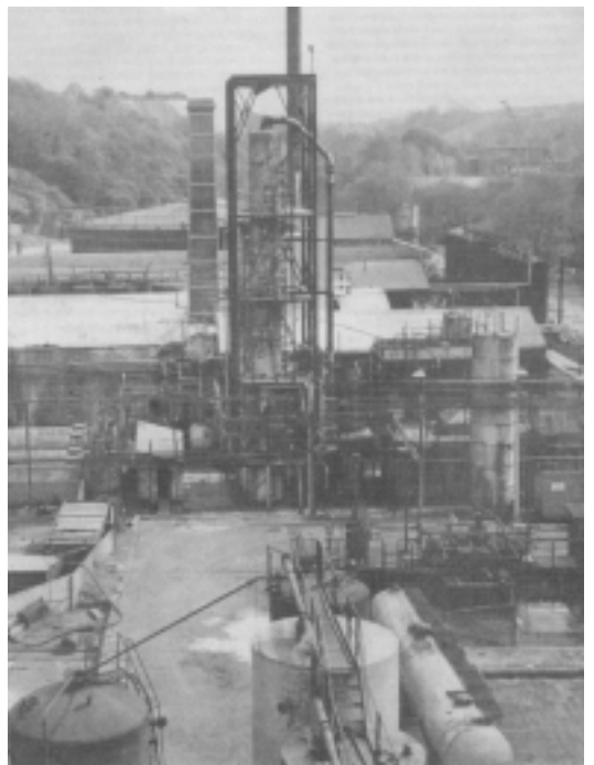
Figure 2: 1954 The modified Lennard continuous pipe still

The Wilton Tar Still was erected at Crew's Hole in 1951, again based on a continuous pipe furnace, it was the main distillation unit until 1973, when British Steel Corporation, Chemicals Division, replaced the furnace with a continuously wound upshot Beverley heater.