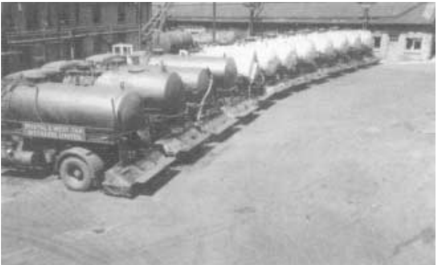
Figure 7: 1954 Tar Spraybars on parade!

On the other hand, the naphthalene content of coke oven tar was much higher than that of gasworks tar. Naphthalene production increased but it was never so profitable as tar acids. Bristol works had a virtual monopoly in sublimed naphthalene, until, following the Flixborough disaster, a hazard survey closed the plant.