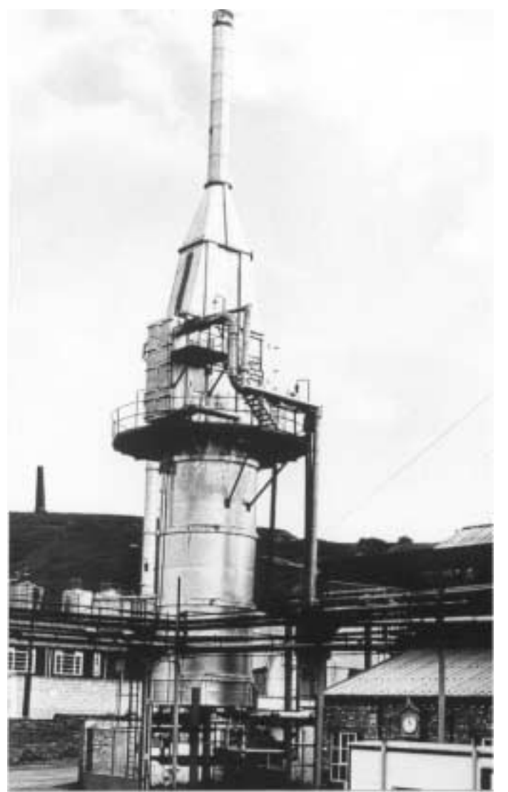
Figure 4: 1973 The continuously wound upshot Beverley heater

This proved to be very efficient but much too fast for the rest of the system and resulted in many problems due to thermal cracking of the cast iron columns, until a slow warm-up technique was developed. One part of the improved system was that all the pumps were to be driven by electricity and not steam. Therefore an Emergency Generator was required. It proved to be very effective when we had power cuts during the 'winter of discontent'! The pitch circulation pumps were also fitted with creosote flushed glands. The other BSC Tar works thought we were mad. There were times when we thought so too!