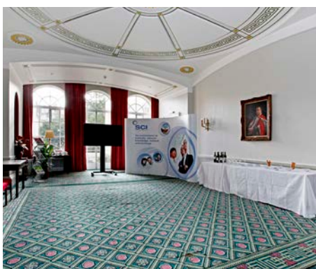
Reception Style: 70