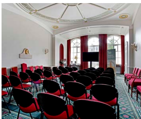
Theatre Style: 45