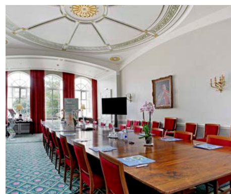
Boardroom Style: 25