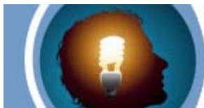
Market Inspired Innovation 20 May, Langstone Technology Park, Havant

The BioResources Group and The Royal Society of Chemistry have been discussing how to collaborate on the 'Improving Agricultural Productivity' stream of the RSC's recently published Roadmap: Chemistry for Tomorrow's World . It is also involved with the British Crop Production Council, considering approaches to addressing the impact of new EU regulations governing registration of crop protection products and the Water Framework Directive. The Group's next meeting and AGM is on 18 May at Belgrave Square. To get involved contact communications@soci.org