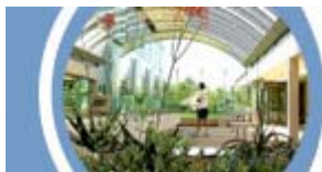
Millennium Seed Bank Tour 18 May, Wakehurst Place, Ardingley