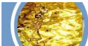
Water: the New Gold - Would you pour this precious raw material down the drain? 8 June, Harrogate

BS 8580 " Risk Assessments for Legionella Control " was held on 8 April 2010 at SCI. Presentations were given by eight experts on all aspects of the BS 8580 standard, including the background to its development. The feedback from delegates will supplement the documented returns from the public comment stage of the standardisation process.