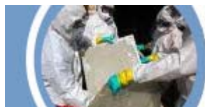
Workshop on the Control of Occupational Exposure to Carcinogenic Chemicals 12 May, Belgrave Sq., London