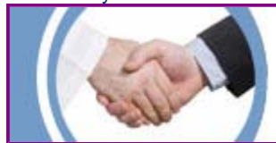
The Marriage of Money to Ideas 22 January 2010

On 25 November, 55 members assembled in Belgrave Square to take part in the Members' Forum and contribute to shape the future of SCI.