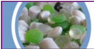
Polymeric Biomaterials 15-16 April 2010