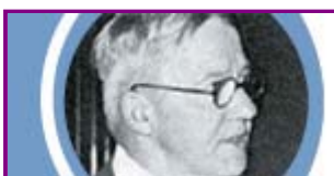
Rideal Lecture: Controlling the Properties of Aqueous Interfaces 10 March 2010

The 14th annual conference of the German-British Forum was held on 20 October, organised jointly by SCI's Science and Enterprise Group, the German Embassy, and other organisations. The conference focused on the actions local governments can take in partnership with businesses and the financial community to generate city-level solutions to tackle social problems and face issues such as climate change.