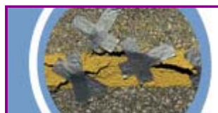
Road Maintenance Treatments 18 March 2010

Go to the Thames & Kennet Group's page Scotland Group