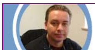
McBain Medal Lecture 11 December 2009

SCI Members may also wish to consider making a donation to this Fund, or even remembering the Benevolent Fund or the Society in their Will to help those less fortunate, and to help advance chemical science in the future.