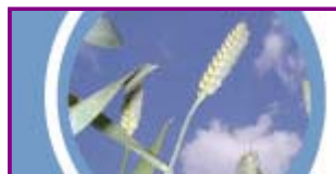
Future Prospects for Chemical insecticides 21 January 2010