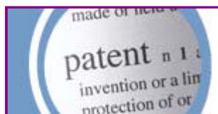
What a Chemist Needs to Know about Patents 29 January 2010