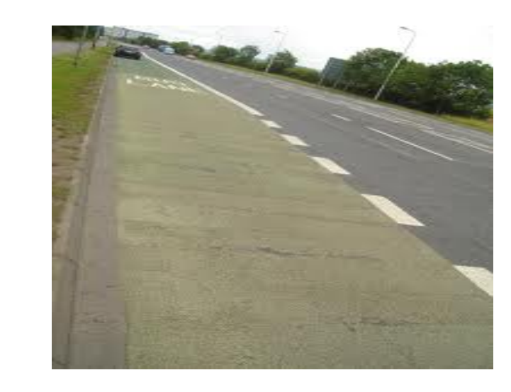
HFS – Short laying period, low durability, tendency to delaminate